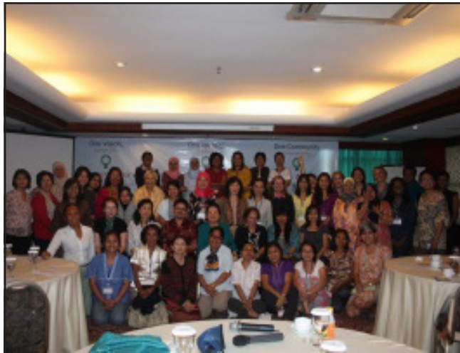
APWLD members united in continuing the education and lobbying work in eth ASEAN including co-organizing the planned caravan with APMM and other groups.

Women's groups in succeeding portions of the program shared their experiences