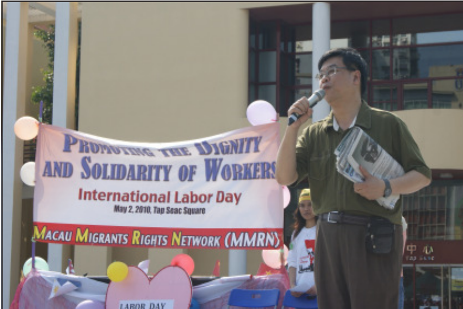
Legislator Ng Kuok Chong expressed solidarity to migrant workers especially on the recent anti-migrant policies in Macau