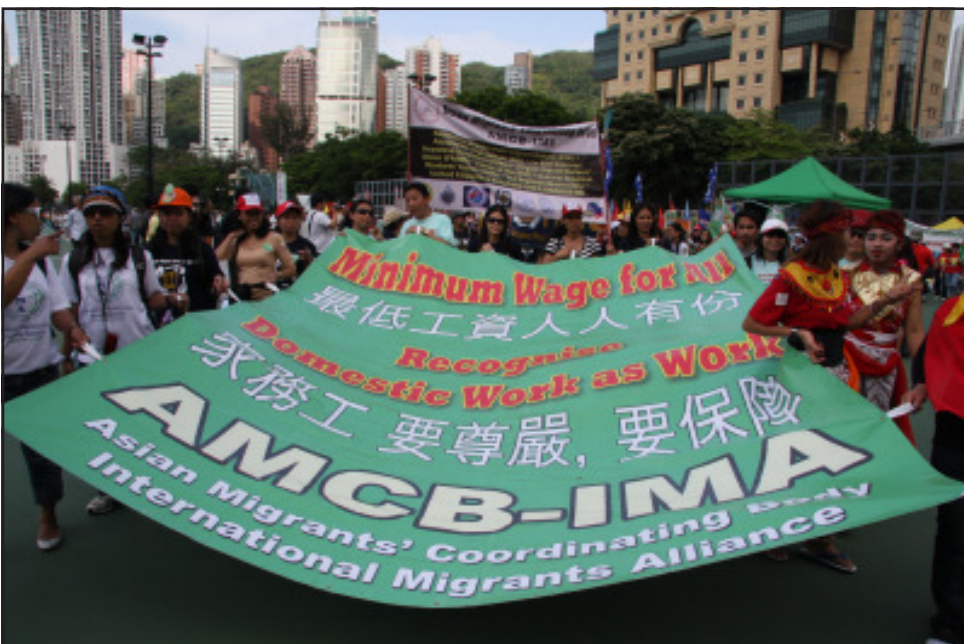
Thousands of Hong Kong migrants under the Asian Migrants Coordinating Body (AMCB-IMA) marched in solidarity with HK workers to call for the promotion of worker's rights and the recognition of domestic work as work.

International Labor Day celebrations in Hong Kong, Macau and Australia were vibrant as migrant workers of different nationalities organized and joined local workers to project their issues. The event was also an opportunity to reach out to local workers who are likewise oppressed and exploited by advocates of neo-liberal globalization.