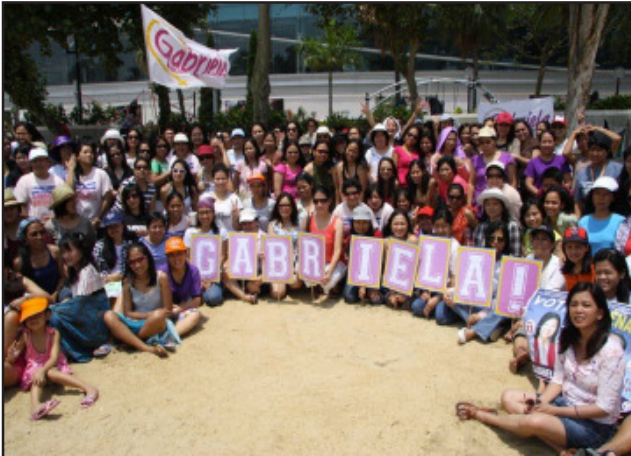
Progressive women's group GABRIELA got the nod of OFWs to represent them in the Philippine Congress. In HK, the group cornered about 30% of the total party-list votes.

Yet again, only a small fraction of overseas Filipino workers went out to participate in the overseas absentee voting for the Philippines' national elections. Only 153,300 OFWs cast their votes from about half a million registered absentee voters.