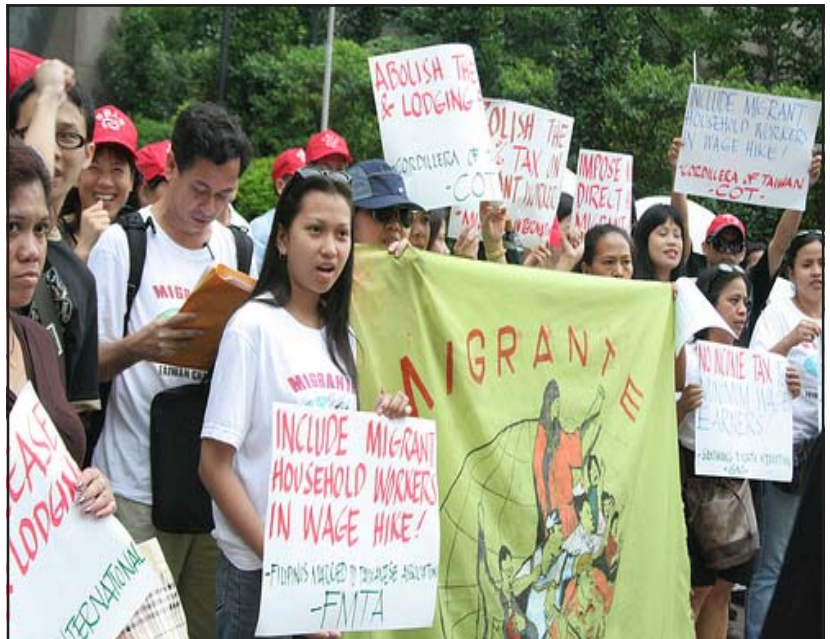
Filipinos in Taiwan expressed their opposition to the increase in board and lodging fee that nullified any benefit of the minimum wage hike increase.

This position of the Philippine government was aired out in a meeting between the Manila Economic and Cultural Office (MECO) and Filipino migrant organizations on August 19. It shows again the inutility of said office in defending the rights and welfare of OFWs in Taiwan.#