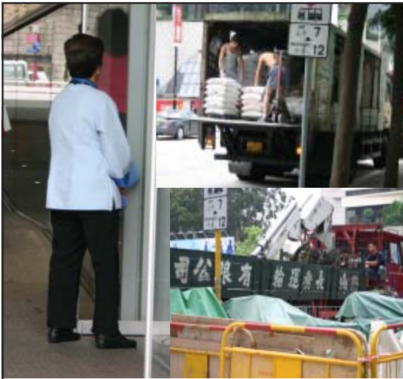
Workers in Asia-Pacific have borne the brunt of attacks of neoliberal globalization to their wage, employment security and rights