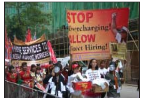
Indonesian migrant workers in HK intensify campaign for their rights

Lestari said even Indonesian migrants who process a new contract with a different employer are forced by the Consulate to pass through recruiters and thus are forced to pay more.