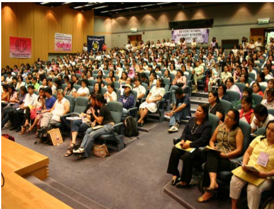
Filipino women migrant workers in Hong Kong came together anew to affirm the ir position taken in the first summit, unite on new issues confronting them, and plan on a common paltform of actions.

Five workshops were conducted on major issues, namely: 1. On the POEA Guidelines, overcharging, illegal charges and government exaction; 2. On Services and Protection of the Philippines and Hong Kong Governments; 3. On the Human Security Act and the Human Rights Situation in the Philippines; 4. On the Campaign for a Legislated Minimum Wage; and, 5. On the Redevelopment of Central, Privatization in Hong Kong, and the Displacement of Migrant Workers.