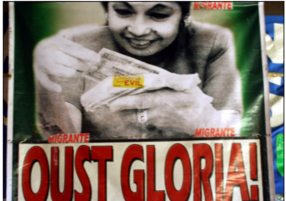
Amidst the worsening economic crisis in the Philippines, the call for ouster of GMA among overseas Filipinos intensifies as the GMA government refuses to scrap the VAT on oil, act on demands to lower remittance charges and even introduces a new fee for migrants.

Last July 25, Migrante International initiated and launched an online petition with major calls to the Philippine government — to remove the remittance