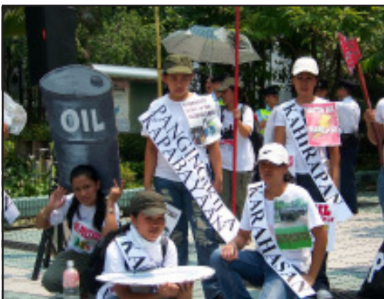
Filipinos in HK brought forward issues of overseas Filipinos in time for GMA's annual state of the nation address

"Gloria is too much! The bank already charges high for what we remit and our corrupt government adds a further cut when our families get our remittance, complained the signatories. OFWs waiting for their turn to sign-up asked, "Why has Gloria not yet been deposed considering she stole the last elections!" They cited in different forms that there was never a progress when Gloria came to power and that she must not stay on until 2010.#