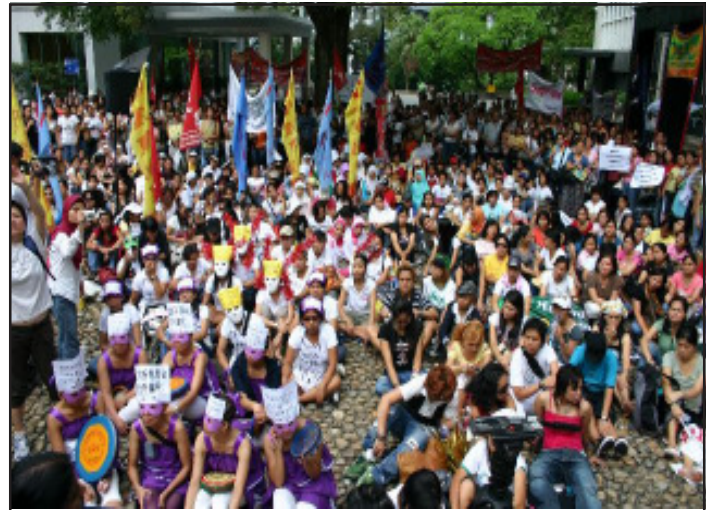
Thousands of Asian FDWs joined the protest action of the AMCB to call for coverage of all contracts on the levy suspension. The rally triggered the HK government's move to adopt the advanced contract renewal system.

According to the AMCB, despite the ACR, there will still be FDWs who will be terminated but shall not be renewed by the employer. Given this situation, they urged the Immigration Department to exempt them from the Two-Week Rule so that they can be given enough time to process visa for another employer and they will also not be forced to go back home.