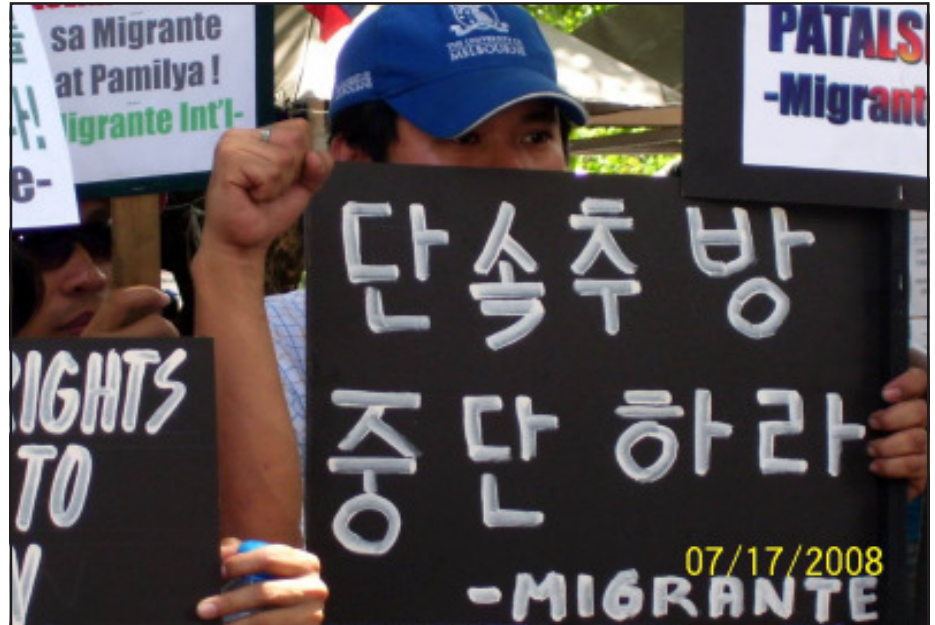
A major agenda of the upcoming International Assembly of Migrants and Refugees (LAMR) will be on the plight of undocumented migrants. Critics have challenged the Global Forum on Migration and Development (GFMD) to prohibit the criminalization of undocumented migrants and work for their legalization

Kuwait's Immigration Department based on the instructions of its Ministry of Interior is preparing a comprehensive report on the number of foreigners in its country. There are reliable sources that made it known that this would lead to the deportation of a large number of Asians especially those who are undocumented. These developments come about in the aftermath of the unprecedented strike and riot of 7,000