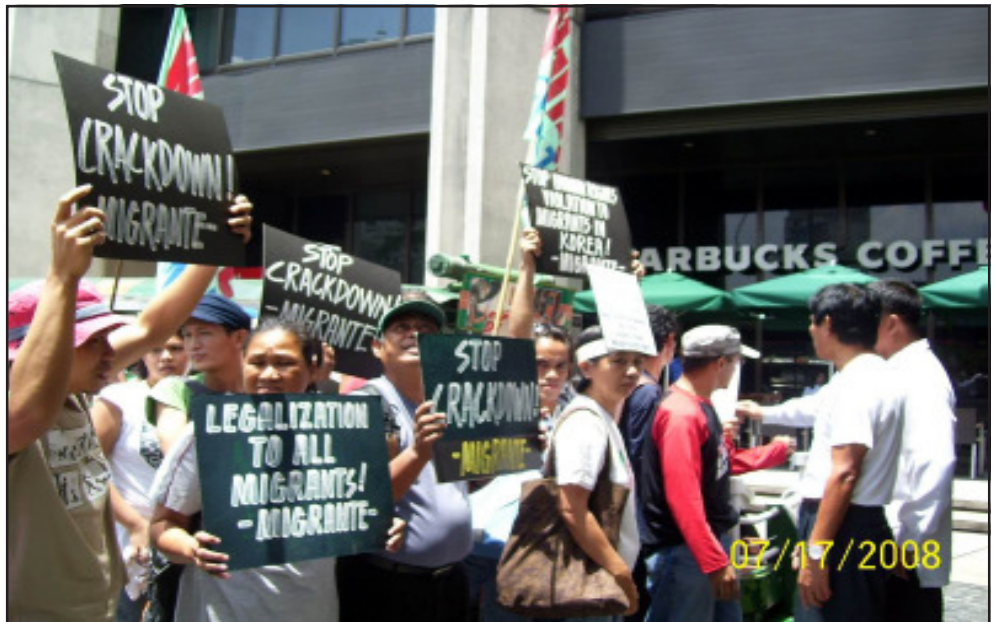
The crackdown, abuse, and torture of undocumented migrants has earned the ire of groups in many countries. In the Philippines, Migrante International held a rally in front of Korean Embassy in Manila together with some of the returned undocumented migrants and their families.

The Philippine government's response to this has been pathetic. Vice President Noli de Castro who would most probably run as the next administration bet in the coming Presidential elections in 2010 suggested that Malaysia postpone the crackdown until after the Ramadan. The Muslim holy festival starts on September 1.