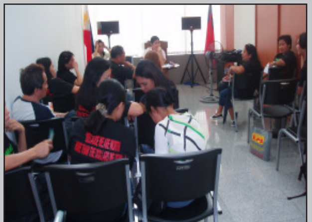
Filipino household service workers in Taiwan hold dialogue with MECO on agency fees

Other issues discussed in the dialogue include the following: