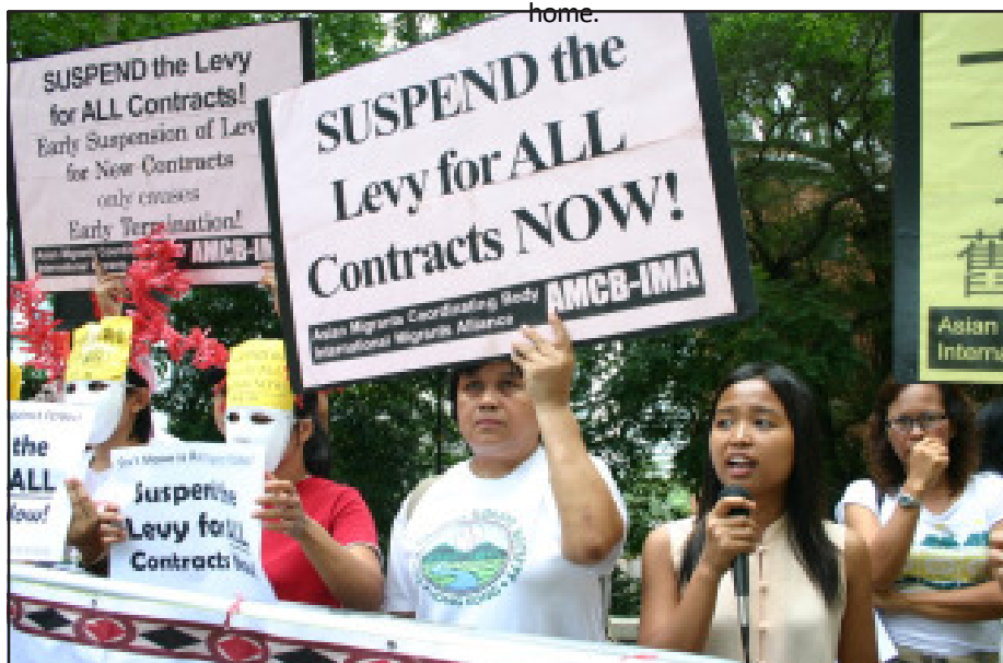
The victory of the levy campaign in HK showed that militant and united actions of migrants are still their best weapon in protecting their rights and upholding their wellbeing.

Finally, they called on all migrant workers to continue to be vigilant in protecting and upholding their rights and wellbeing. Through their collective actions, victory was gained in the levy suspension.