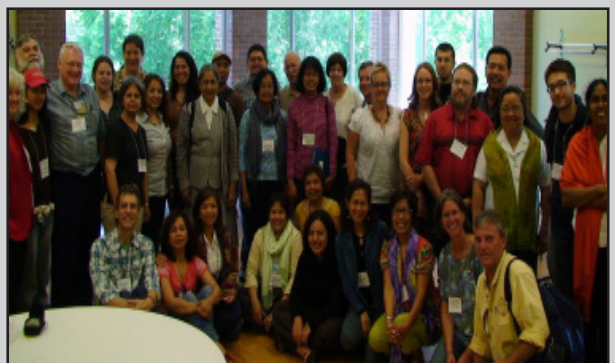
Participants of the national gatherings organized by KAIROS Canada strengthened solidarity with each other.

The participants to the gathering agreed to work together as a network and a coordinating group was formed. The participants also agreed to work together for the 3 rd National Migrants gathering to be held in 2011.#