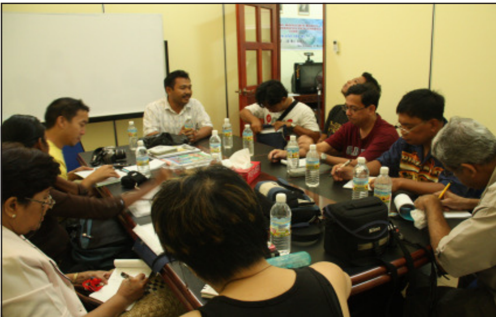
Members of the fact-finding mission spent five days interviewing migrant workers and various other sectors to gain a better and deeper understanding on the situation of foreign workers in Sabah, Malaysia. Results of the FFM shall be used by participating organizations in lobbying and advocacy efforts for the rights of migrants.

MALAYSIA IS A HOTBED of abuses against migrant workers. After the Fact Finding Mission in Sabah organized by the Asia Pacific Mission for Migrants (APMM) and participated in by various NGO's and migrant organizations, this fact is even better established.