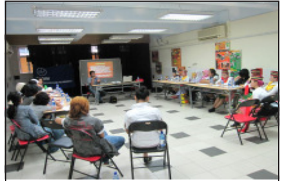
APMM and LBH also reached out to IMWs in Macau to educate the broadest number of migrants on the insurance issue.

As a follow up for the training, APMM, ATKI, LBH-DIY, Bethune House and the Mission for Migrant Workers (MFMW) are in the process of developing a system for assisting IMWs