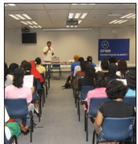
IMWs listened to the representative from LBH as he discussed to them the insurance scheme and how can one claim it.

For example, each one of the 700,000 IMWs deployed each year pays an insurance fee that amounts to Rp280 billion.