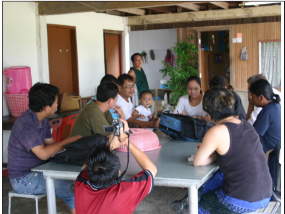
Members of the FFM interviewed migrant workers - undocumented and documented ones - advocates, churchpeople and representatives of government bodies to get a clear picture of the situation of migrant workers in Sabah.

The Tawau team looked into the situation of migrant workers in palm oil plantations. There, they interviewed migrant workers, mostly undocumented, in Tawau proper and Semporna. They also