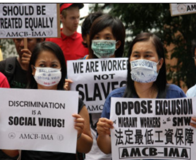
Foreign domestic workers in Hong Kong vowed to pursue the campaign against the exclusion of FDWs to the minimum wage as proposed by the ExCo.

The group also hit what they called as the hypocrisy of the Exco when it claimed