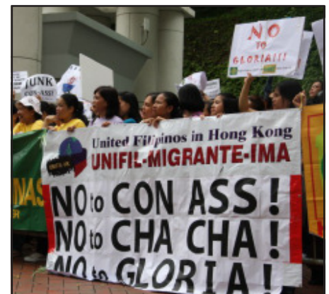
Overseas Filipino workers bounded GMA in a side trip to Hong Kong for pushing charter change