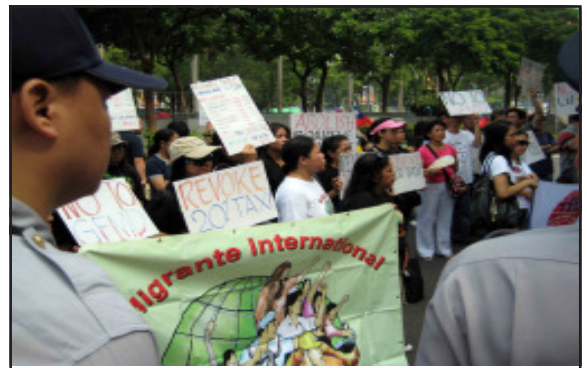
Migrants and advocates in Taiwan resist the proposed regressive tax in time also for the GFMD campaign.

When told by the migrant workers that there are many deductions on their pay which the CLA legalized, the MOF admitted that they were not aware of this and that there should be a new tax rate for migrants. Said oppressive tax rate is also one reason why newly arrived migrant workers are hesitant to complain against exploitative practices of their