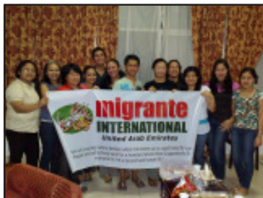
Migrante in the UAE continues to expand its membership in the country with chapter building in various areas.

The formation of Migrante – RAK is a milestone in the organizing work in the whole of the United Arab Emirates. Migrante had its first chapter in the UAE in Dubai. Aside from offering immediate assistance to more distressed migrant workers, Migrante– UAE will be able to effectively take a more leading role in developing the migrants' movement there while at the same time supporting the peoples movement in the Philippines. #