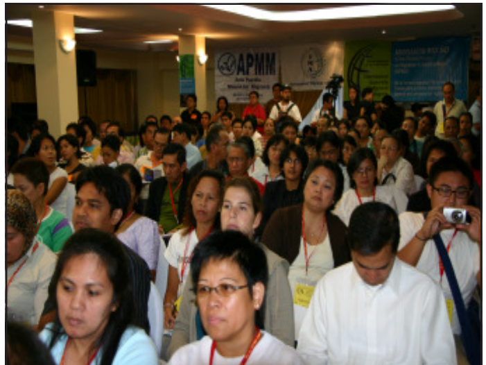
The International Assembly of Migrants and Refugees gathered grassroots migrants, immigrants and refugee organizations to oppose the neoliberal agenda of the GFMD and call for actions to their concrete issues.

The UN Special Rapporteurs on Migration and Slavery graced the occasion of the IAMR. Many of the more than 200 delegates of the migrants and refugees are members of the International Migrant Alliance (IMA) which was recently set up in Hong Kong on June 15 – 16 this year. The IAMR is a joint undertaking the IMA, Migrante International, the Asia Pacific