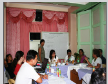
Challenging the GFMD was the first major campaign of the IMA after its founding. The group gears for more actions in the future.

In order to ensure the implementation of the plan, a working committee to be composed by ICB members and representatives from IMA member organizations was proposed and approved. The working committee will be led by members of the ICB. #