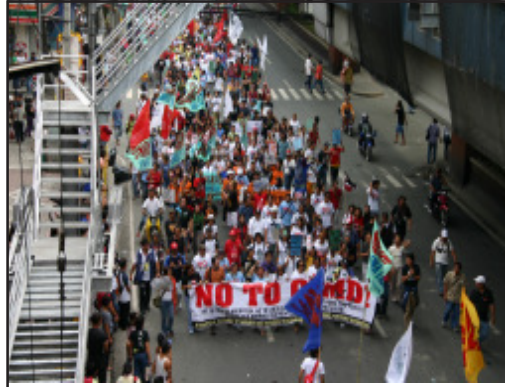
Thousands of migrants, their families and advocates for the rights of migrants joined the various protest actions to mark their position against the GFMD.