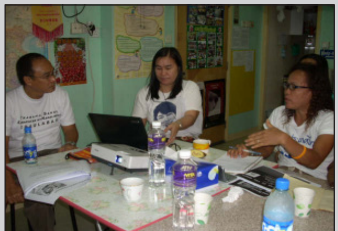
The training of migrants educators on GFMD was done in cooperation with the Asian Pacific Forum on Women, Law and Development (APWLD) and the Mission for Migrant Workers (HK) Society

radio program that is aired on Sundays. It will also send their official representative to the IAMR, an activity that will challenge the GFMD as well as expose the so-called model labor export policy of the Philippine government that is hosting the 2 nd GFMD at the PICC, Manila.