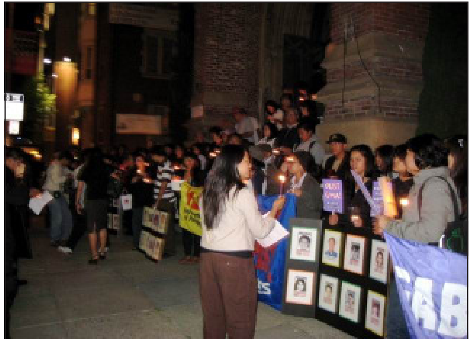
Abroad, Filipino migrants call for a stop to the 'undeclared Martial Law' of Pres. Gloria Macapagal-Arroyo. Human rights abuses remain unabated in the country.