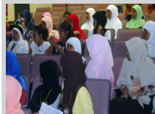
Indonesian migrants in Hong Kong tackled the GFMD in a summit attended by various organizations. They discussed the impacts of GFMD to migrants as well as the Indonesian policies on migration.